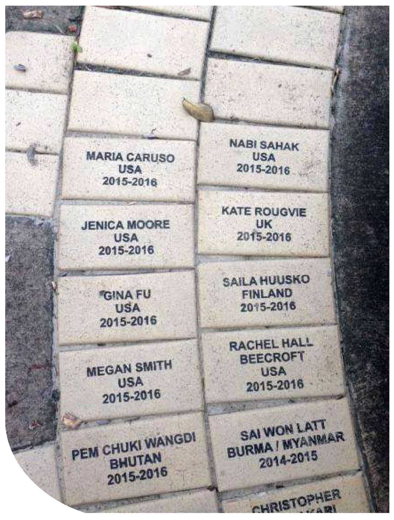
All Peace Fellows who attend the University of Queensland program are recognised at the completion of their degree with a paver stating their name, country of origin and date of program. These are laid in the Rotary Presidential Peace Park adjacent to the campus.